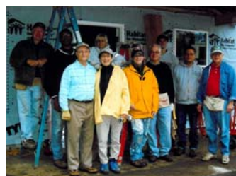
Members of the 2009 North Habitat Crew

Stay tuned for more information in September on ways you can help support North's team Habitat!