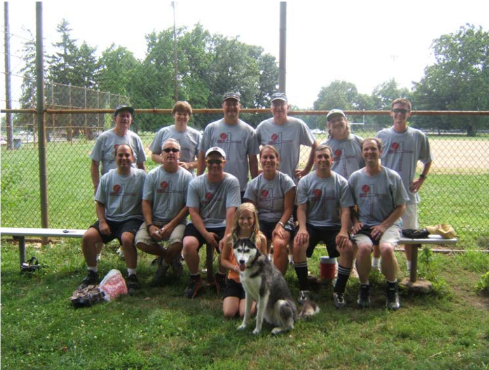
2010 NORTH SOFTBALL TEAM

AUGUST 2010 NORTH UNITED METHODIST CHURCH WHERE SPIRITUAL JOURNEYS MEET